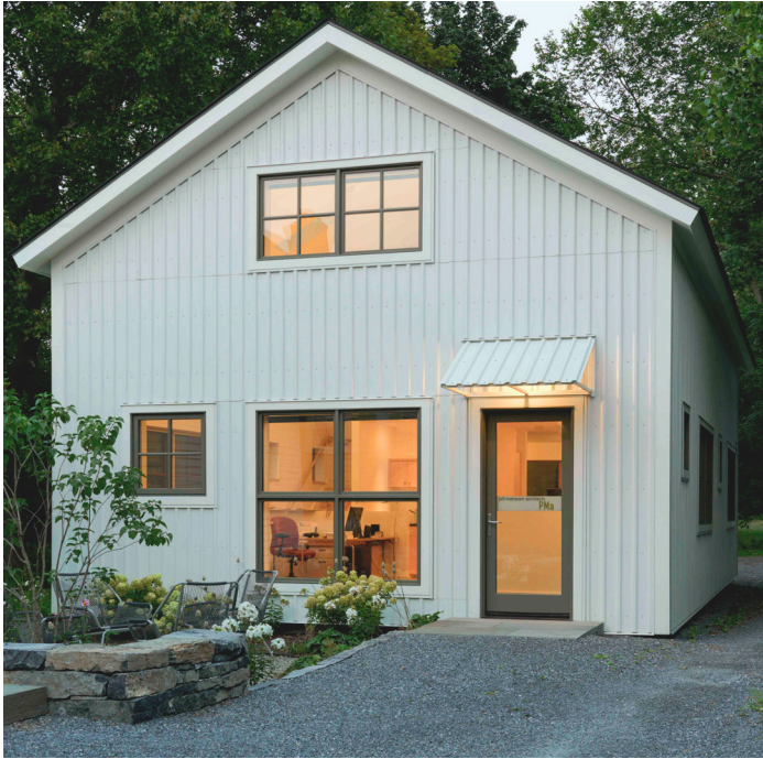
2015 VT's Greenest Building - Commercial + People's Choice Award Pill-Maharam Architects office - deep energy retrofit

VGBN recognized the most energy efficient buildings in Vermont at the Vermont Green Building Gala, held at Main St. Landing on March 31, 2016. VGBN's Vermont's Greenest Building Awards are a statewide competition that honors residential and commercial buildings that meet the highest standard of demonstrated building energy performance.